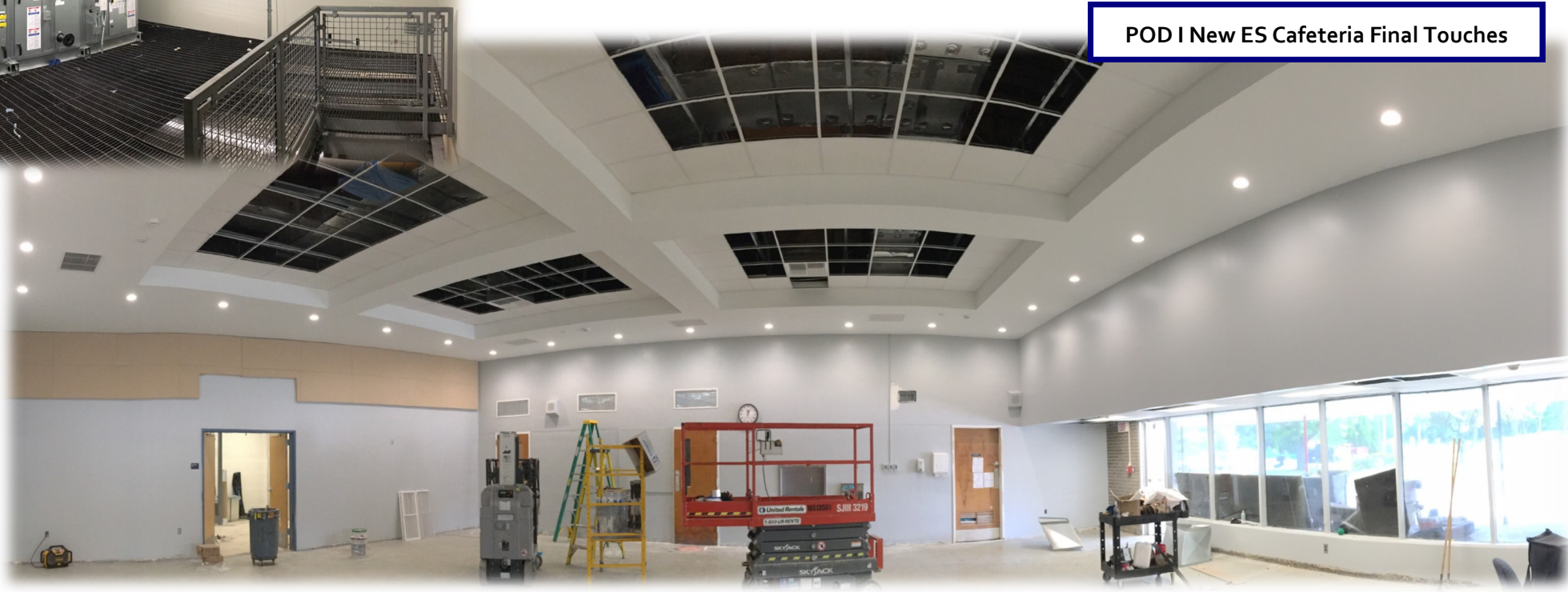
POD I New ES Cafeteria Final Touches