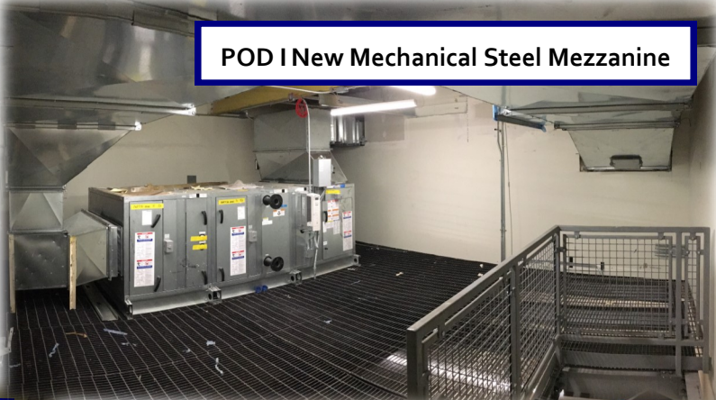
POD I New Mechanical Steel Mezzanine