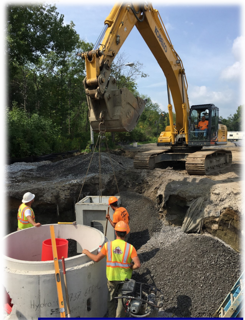
HS Storm System Installation Student Parking Lot