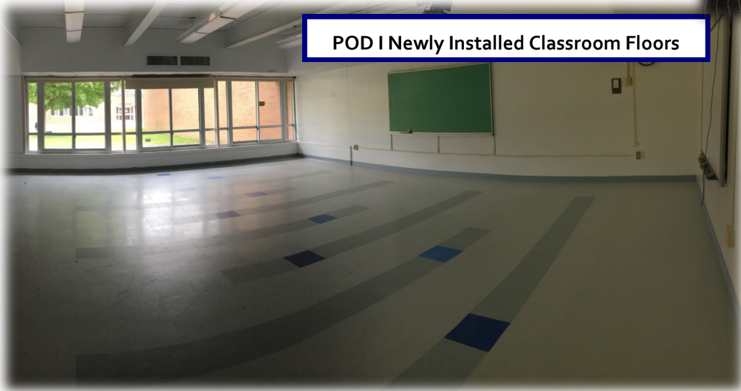
POD I Newly Installed Classroom Floors